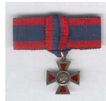
The Royal Red Cross