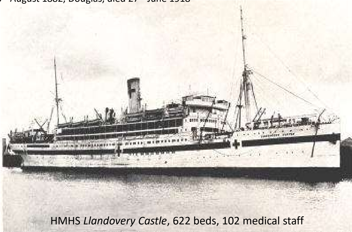
HMHS Llandovery Castle , 622 beds, 102 medical staff

Born 16 th August 1882, Douglas, died 27 th June 1918