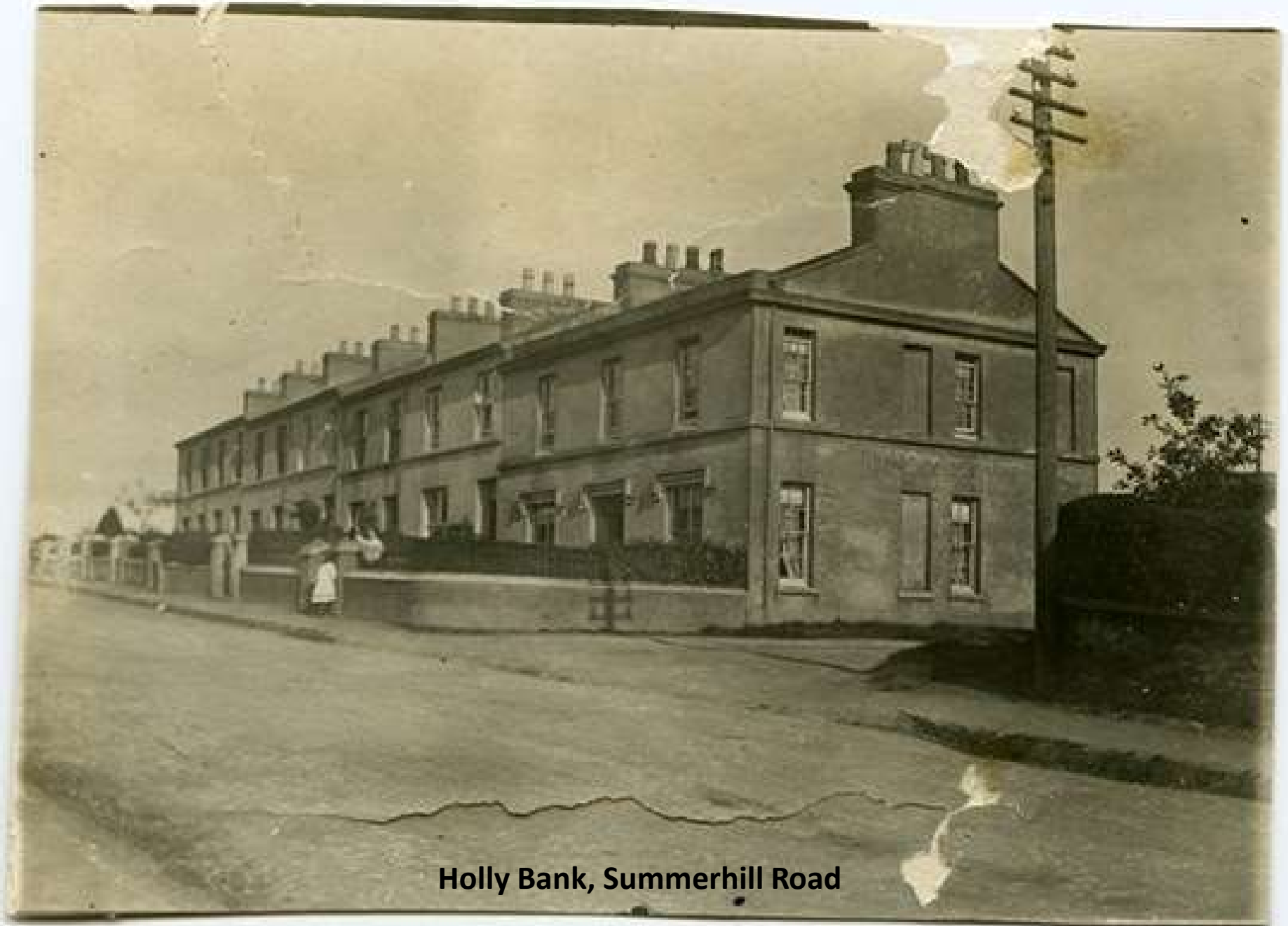
Holly Bank, Summerhill Road